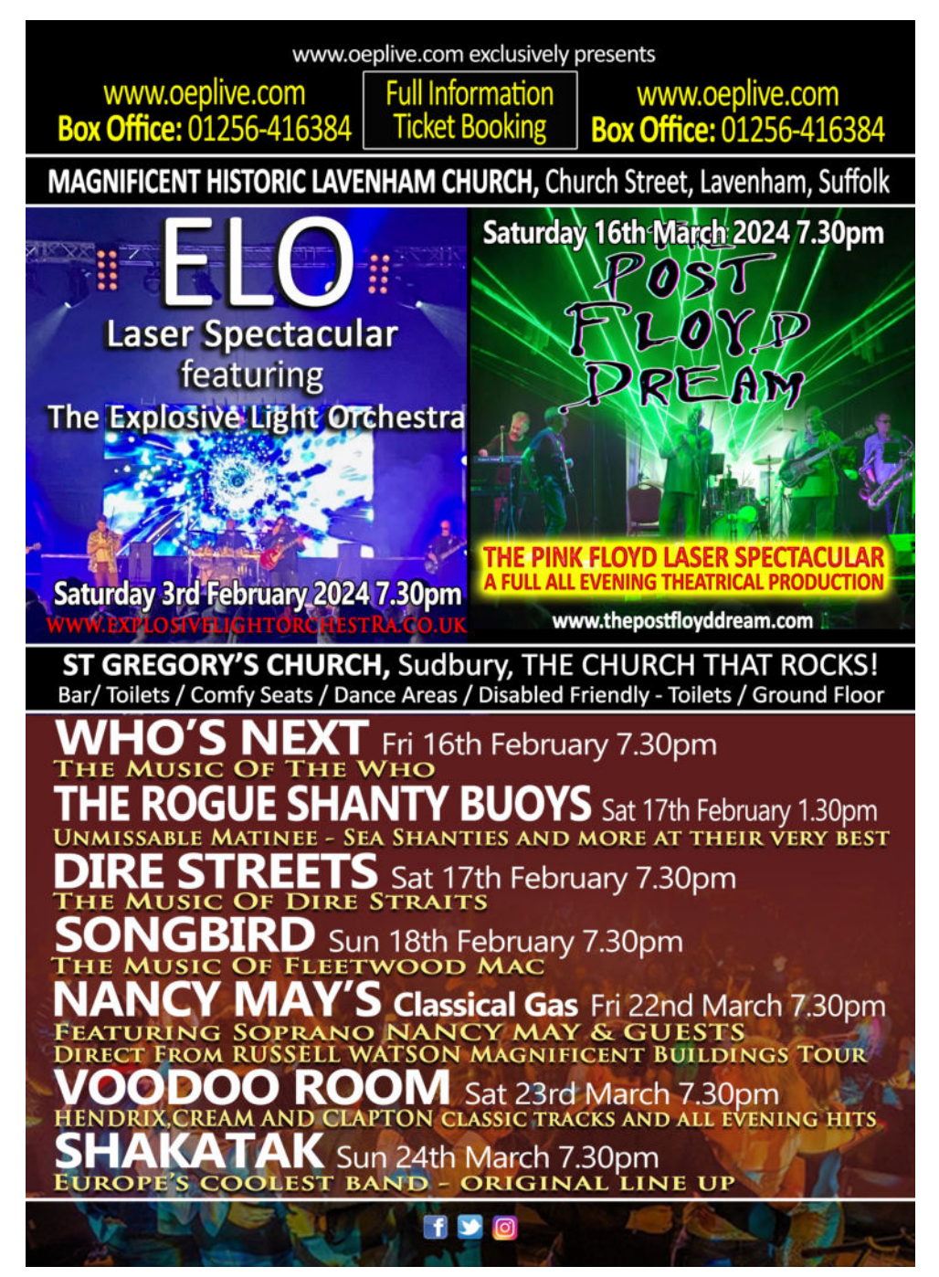
Dedham Parish Magazine thanks the Advertisers for their support