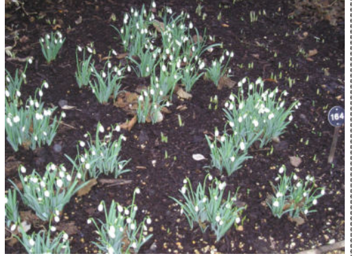
Snow drops at Anglesey Abbey

If you're like me and there's not much happening in your garden this month, why not get out to one of the region's great gardens to see what inspiration they have to offer instead?