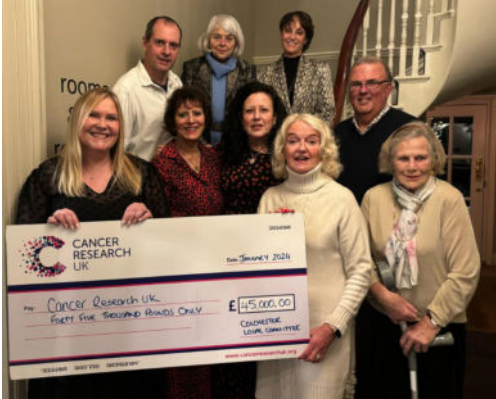
A Colchester fundraising group is celebrating raising £45,000 for Cancer Research UK in the last year. The Colchester Local Committee began

fundraising for the charity's life-saving work in 1962. The £45,000 was raised through a variety of events, including a Race Night, Quiz, Christmas Wreath-Making and their annual Summer Ball, as well as In Memoriam donations from funeral directors in the local area.