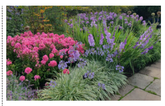
Phlox, Gladioli and Agapanthus at Wisley

Start with a big, healthy mother plant, lift it and wash as much soil off as you can to expose the roots. Cut off young, pencil-thick samples close to the crown and discard the thin end. Remove any